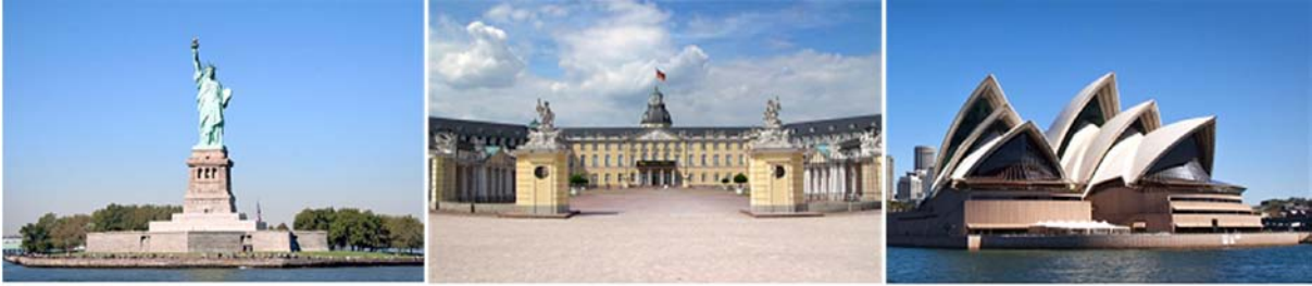
Lean in the Public Sector Conference - December 9 - 11, 2009 - KIT, Karlsruhe, Germany