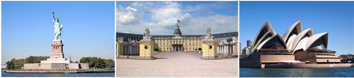
Lean in the Public Sector Conference - December 9 - 11, 2009 - KIT, Karlsruhe, Germany